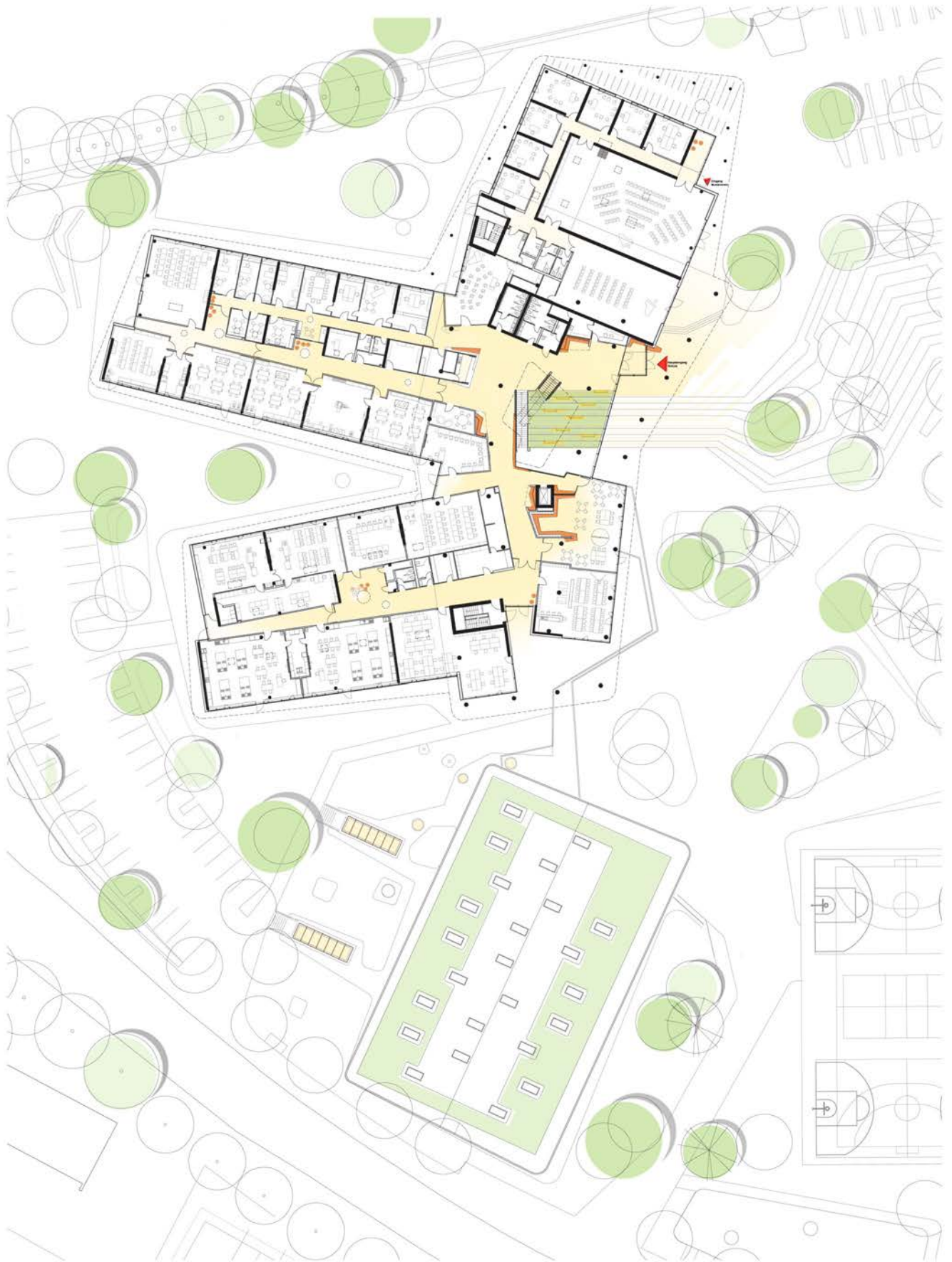
Floor plan level 1