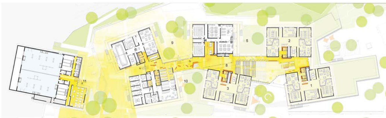
Floor plan level 2